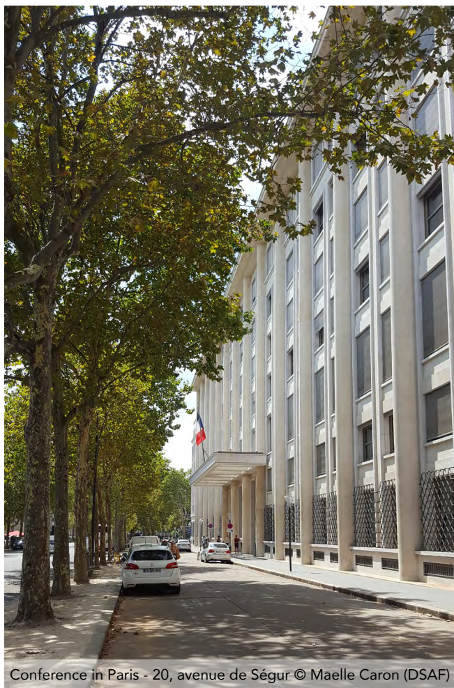
Conference in Paris - 20, avenue de Ségur

Conference on 15 November 2019 in Paris: "Twenty years of reparation for anti-semitic spoliation during the Occupation: between compensation and restitution"