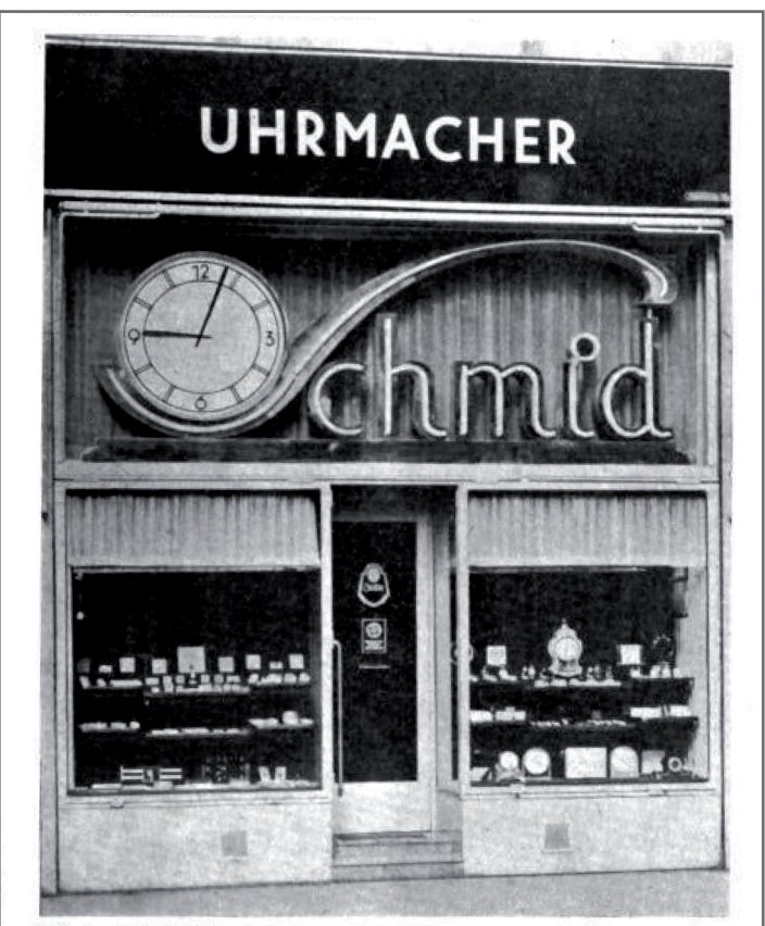
Mit dem Wort "Uhrmacher" kennzeichnet sich die Unlösbarkeit von gutem Uhrmachergeschäft und Uhrmacher

After the Second World War, the Provisional Government of Austria established special courts to prosecute Nazi crimes. The Prohibition Act (Verbotsgesetz) of 8 May 1945 and the War Criminals Act (Kriegsverbrechergesetz) of 26 June 1945 laid the foundations for the ten years during which the Volksgericht system was in operation. Most of the Prohibition Act is still in force today, including the provisions banning NSDAP activities and the public denial, trivialization, endorsement and justification of Nazi crimes. Apart from imprisonment and the death penalty,