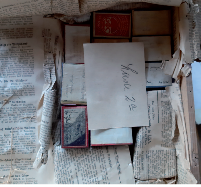
Crate mollusc shells Göttweig Abbey

tion of Austria with the German Reich, on 15 September the Vienna Gestapo ordered the complete expropriation of the abbey in favour of the city of Krems. Thereafter, practically all of the furniture was removed from the building along with the art and natural history collections.