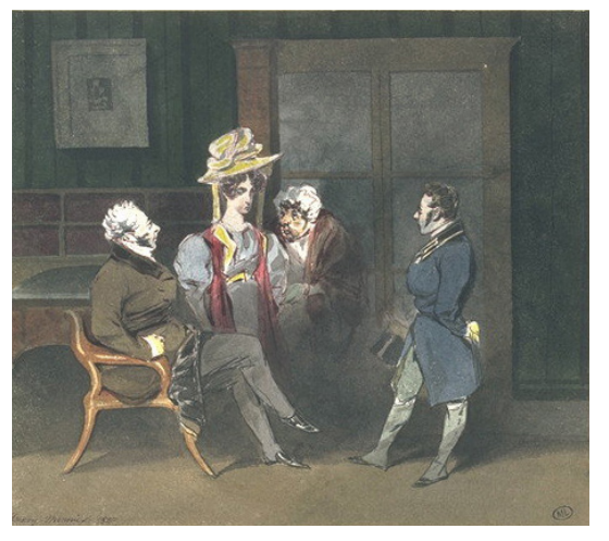
LES VISITEURS HENRY BONAVENTURE MONNIER