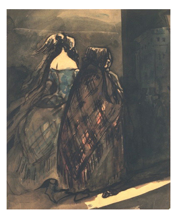
JEUNE FEMME ET SA DUÈGNE CONSTANTIN GUYS