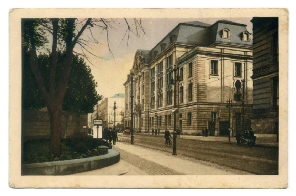
BERLIN ART LIBRARY

In the first Newsletter, published by the Network of European Restitution Committees on Nazi-Looted Art, the Chairman of the CIVS - the Restitution Committee in France - wrote: "The study of a case [...] can [...] enrich our reflections and question our practices." This holds even truer for a case which was the subject of multiple decisions issued by different national bodies, such as the one about Curt Glaser. A comparative study will not only address the facts of the case - especially the circumstances of loss - but also, and foremost, the way each restitution system